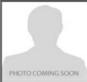
PHOTO COMING SOON